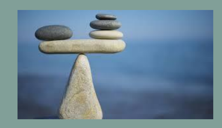
Fragility and Resilience