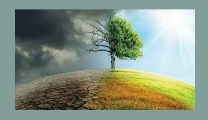
Climate & Environment