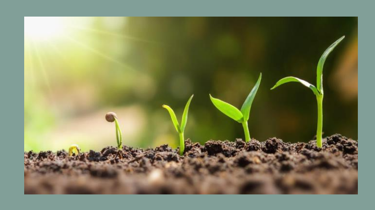
Social protection, Inequality and Inclusive Growth